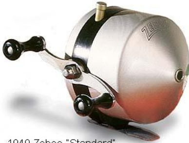
1949 Zebco "Standard"

Eventually I got one, and have forever since been grateful to the man who invented it, and also to my neighbor who showed it to me. Mind you, I caught fish with my cane pole and also with my open-faced reel, but this closed-face beauty so enhanced my fishing experience! Ah, the joys of fishing!