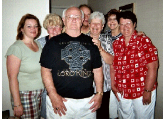
Tour to Kansas City IHOP

Thank you again for your love, your prayer support and for your tangible financial partnership in my walk and ministry to Him.