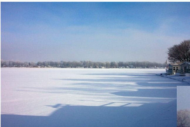
Winter shadows at the lake: The frozen tundra of Lakes Estates.