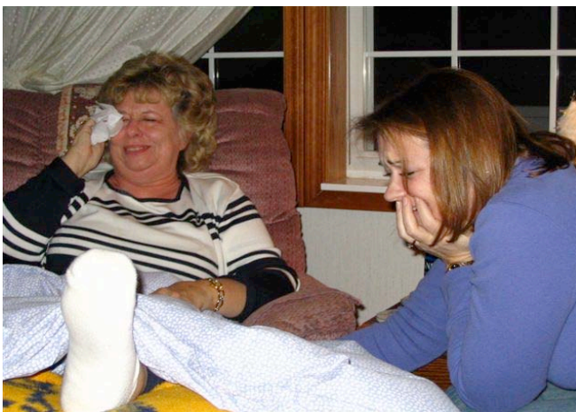
In His Presence there is Fullness of Joy!