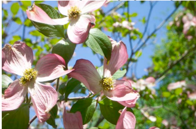
The Miracle of Resurrection!

nature cannot help being a shadow of its Maker and Creator! Resurrection! New Beginnings! New Life! Hooray, Jesus!